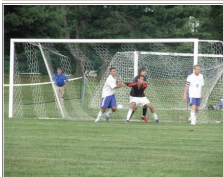
Dott working hard in net during a corner kick