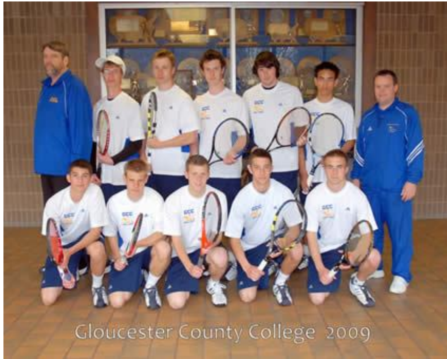
Gloucester County College 2009