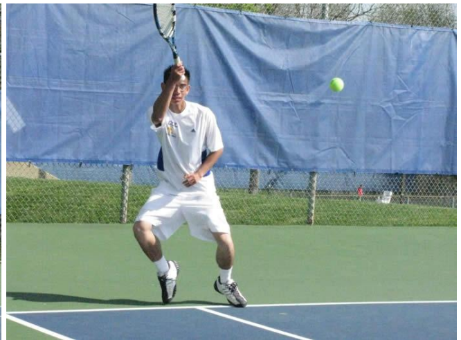
Lo returns serve