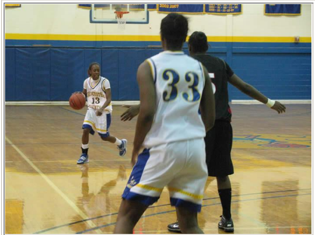
Farmer controls the ball - she finished with 6 assists