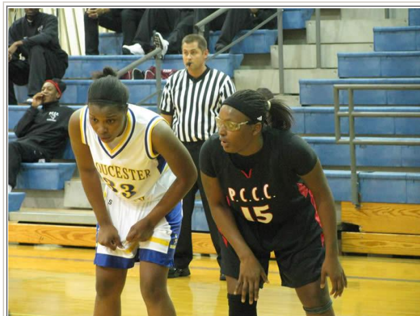
Matthews prepares to battle for a rebound