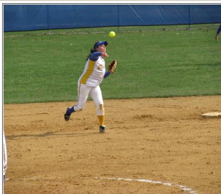
SS Sampolski throws out a batter