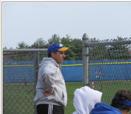
Coach D focused on the game