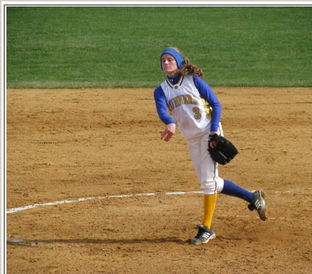
Trotter on the mound Sunday