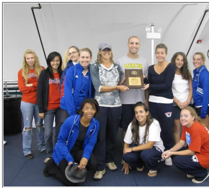
The Roadrunners shared 2nd place with Brookdale CC