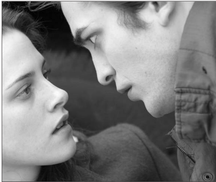
Kristen Stewart and Robert Pattinson star in the movie version of popular novel series.

You’ll find yourself wanting to fall in love