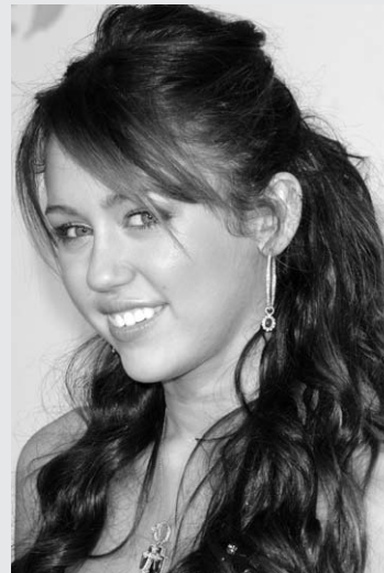
Miley Cyrus, famous for her alter ego, Hannah Montana and dad, country swooner Billy Ray Cyrus.