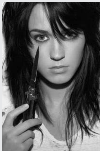
Katy Perry, famous for her break out single “I Kissed A Girl” is Britain’s famous export.