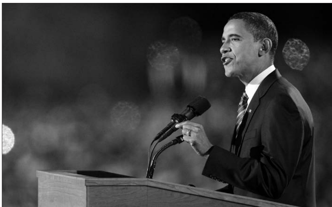
President-elect Barack Obama gives his acceptance speech after it is announced he has won the presidential election at his Election Night Rally in Grant Park, Chicago, Illinois, November 4, 2008.

"Obama is an important signal to the world about the ability to overcome such a wretched history of conflict and hatred," he said, "and to