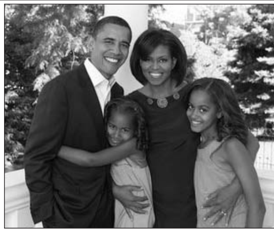
Soon-to-be first family of the U.S.